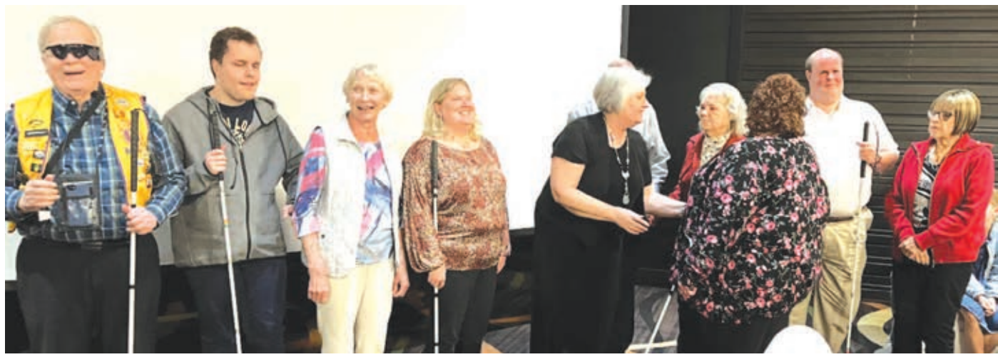
We had another wonderful evening at Dining In The Dark! Thank you to NDAB for partnering with us on this great event! As one participant said, "you gain a lot of appreciation for your sense of sight with even the smallest things like knowing the difference between a salt and pepper shaker". We couldn't agree more!