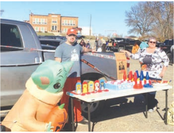
Tuttle Lions Club sponsored their first Trunk-n-Treat Event! 50-55 kids walked Tuttle's Main Street where 27 trunks showed up to support this event. Free pie and refreshments were served, by Tuttle Lions, inside the Methodist Church for everyone. A good time was had by all!