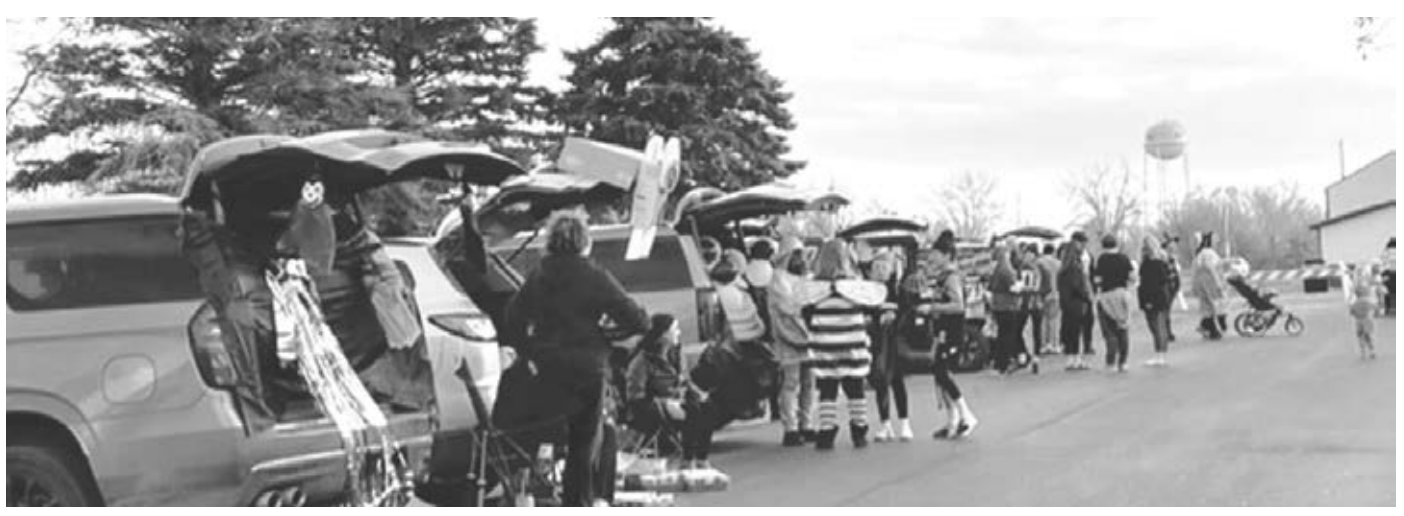
New Rockford Lions Club hosted Trunk and Treat Halloween night. It was a beautiful night with a great turn out. Several of the participants got into the spirit by decorating their vehicles. The Lions club gave out little stuffed animals and full-size candy bars to all the trick and treaters. Approximately 225 trick and treaters came to the event.