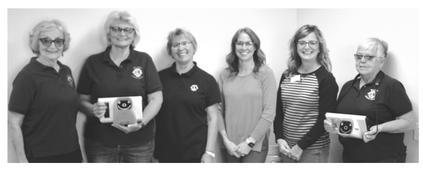
Members of the Hazen Lions Club come to the Energy Capital Cooperative Child Care Center Tuesday morning, where they work with Custer Health and the child care staff to provide free vision screening for kids. The screening can help detect potential vision issues in children. The screenings are offered to anyone from 6 months of age on up.

sion screenings. On Tuesday morning, they visited the Energy Capital Cooperative Child Care Center's New Bethel Daycare in Hazen.