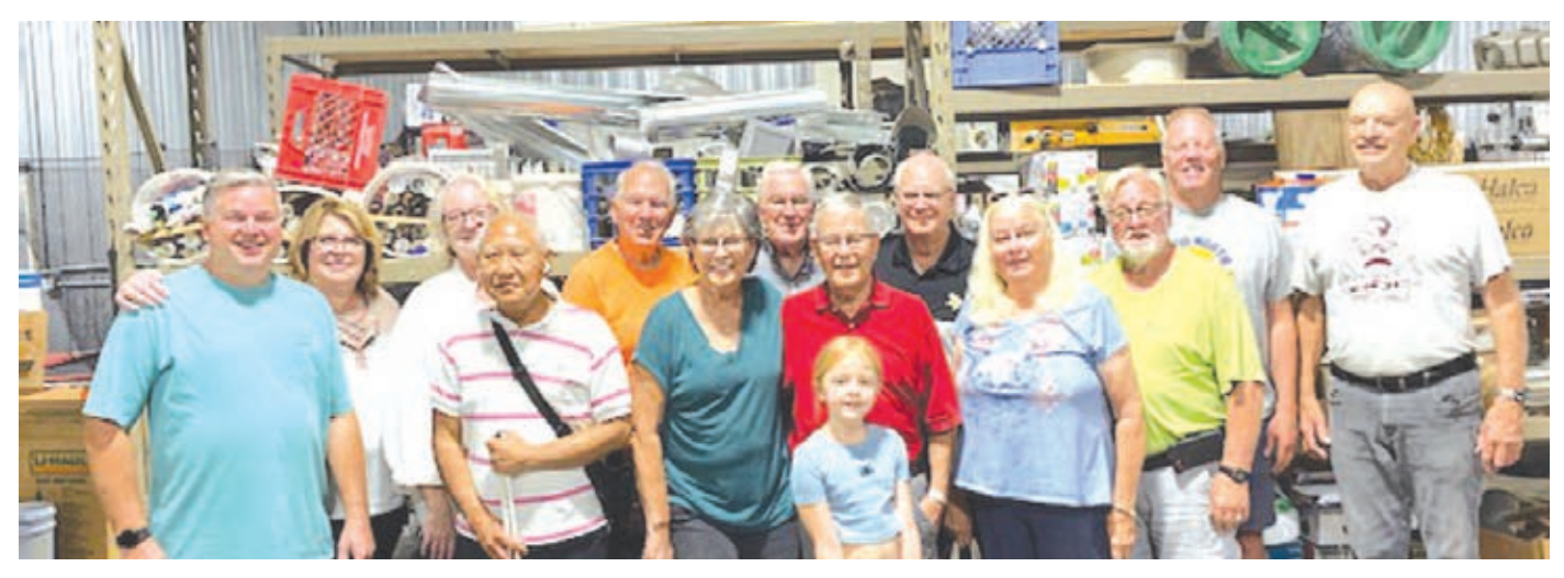
Pictured is a group of Fargo Lions and Gateway Lions who meet periodically to process the recycled glasses collected by the various Lions clubs throughout District 5NE. Thousands of eyeglasses are recycled yearly by Lions clubs throughout North Dakota

DISTRICT 5NE: Fargo Lions oversee the Eyeglasses Recycling program in 5NE. Lions clubs throughout District 5NE collect the glasses and bring them to Fargo. Bergstrom Eye & Laser Clinic volunteers as a dropoff point. Glasses are then transported to EG Properties warehouse for storage, processing, and cleaning by local Lions clubs. A portion