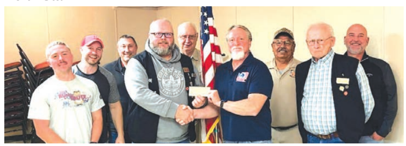
Pictured are Veterans from the North Star Lions presenting a check for $1000 to the Western ND Honor Flight.