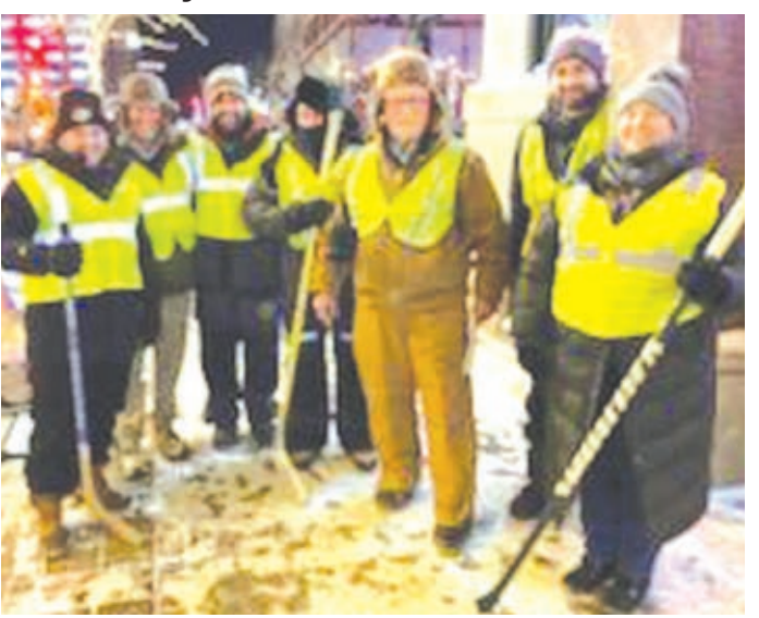
Members of the Gateway Lions Club helped patrol the Winter "PARADE OF LIGHTS" in downtown Fargo on Saturday, December 3rd. The temperature was a balmy 5 degrees