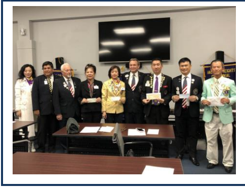
San Gabriel Region Club Presidents presenting combined donation of $25,000+ for Wildfire Relief.