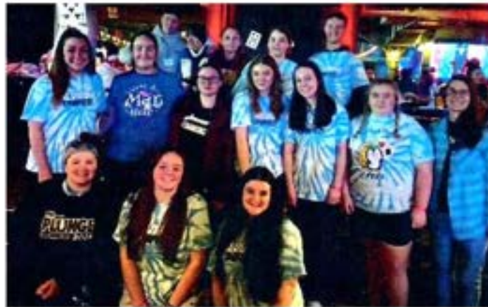
Alvirne High School Hudson, NH