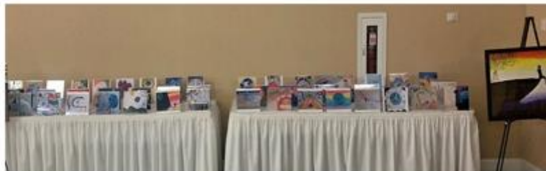
2023 –2024 Participants Peace Poster Display at the Mid-Winter Convention. Displayed on the right is a glimpse of 2nd place winner Molly Mitchell’s poster sponsored by the Chesterfield Lions.