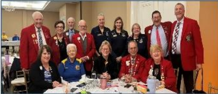
Hudson Lions at the MD 44 Mid-Winter Cabinet Meeting 2024