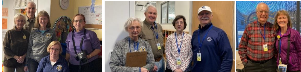
Nashua's vision screening team