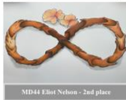
MD44 Eliot Nelson - 2nd place