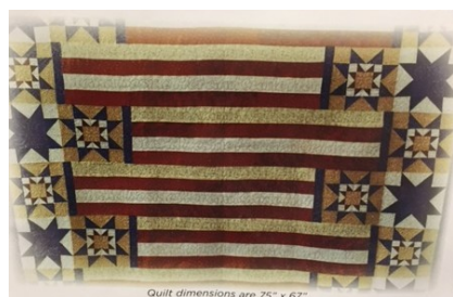
Quilt dimensions are 75" x 67"

The club will be making Funnel Cakes and Corn Fritters for sale as well.