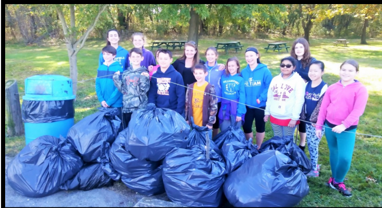
Pictured are the Springfield LEOS picking up trash & with finished tree.