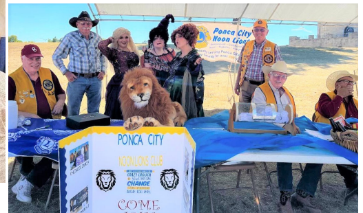
Pics from Ponca City Noon & Oktoberfest 10-2-22. The student nurses did 53 blood glucose tests and 131 children were screened.