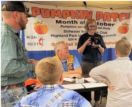
Stillwater, be sure to visit the Patch and say hi to the Lions.

Stillwater Noon- The club is running the Pumpkin Patch at the High-