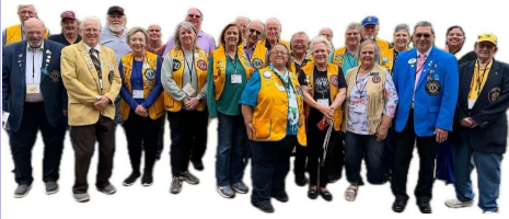
All 3E Lions