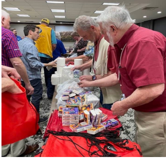
Packing backpacks for the Homeless in Lawton.