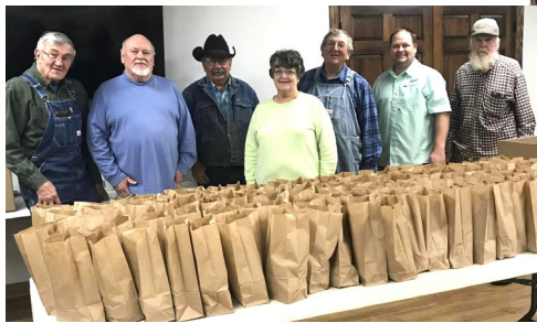
Below Lomega Pictures of 4H goodie bags.