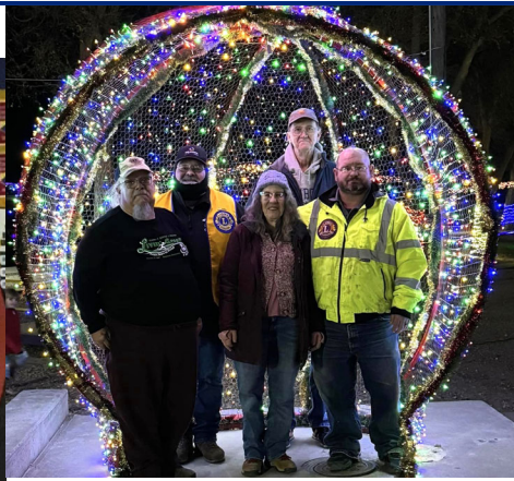
Guymon Lions Club – Volunteers from the Guymon and Goodwell Lions club provided train rides through the Thompson Park/Sunset Lake.