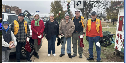
Perry Splash Pad and Playground, Perry Lions Club – An official park dedication of the new playground at Perry Lions Park took place on December 6. The volunteer lead project was made possible by many generous partners and amazing people. A great celebration!