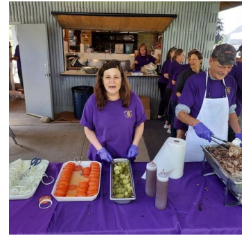
Northport's BBQ held Labor Day