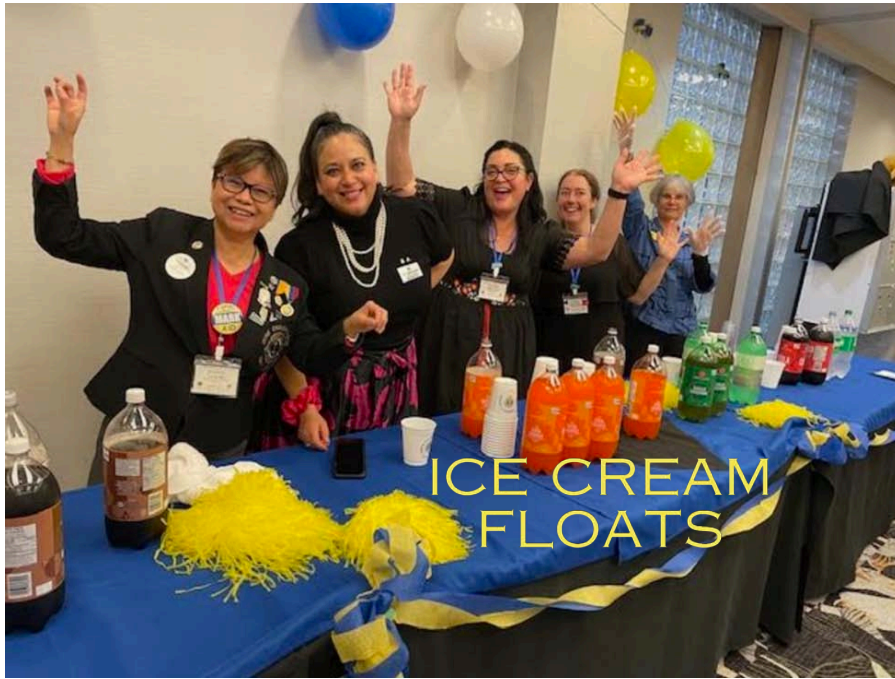
ICE CREAM FLOATS