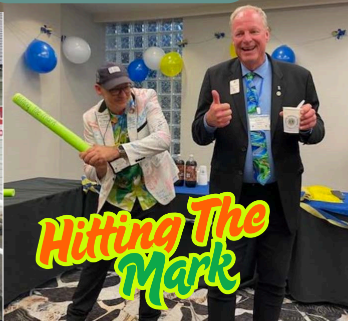
Hitting The Mark