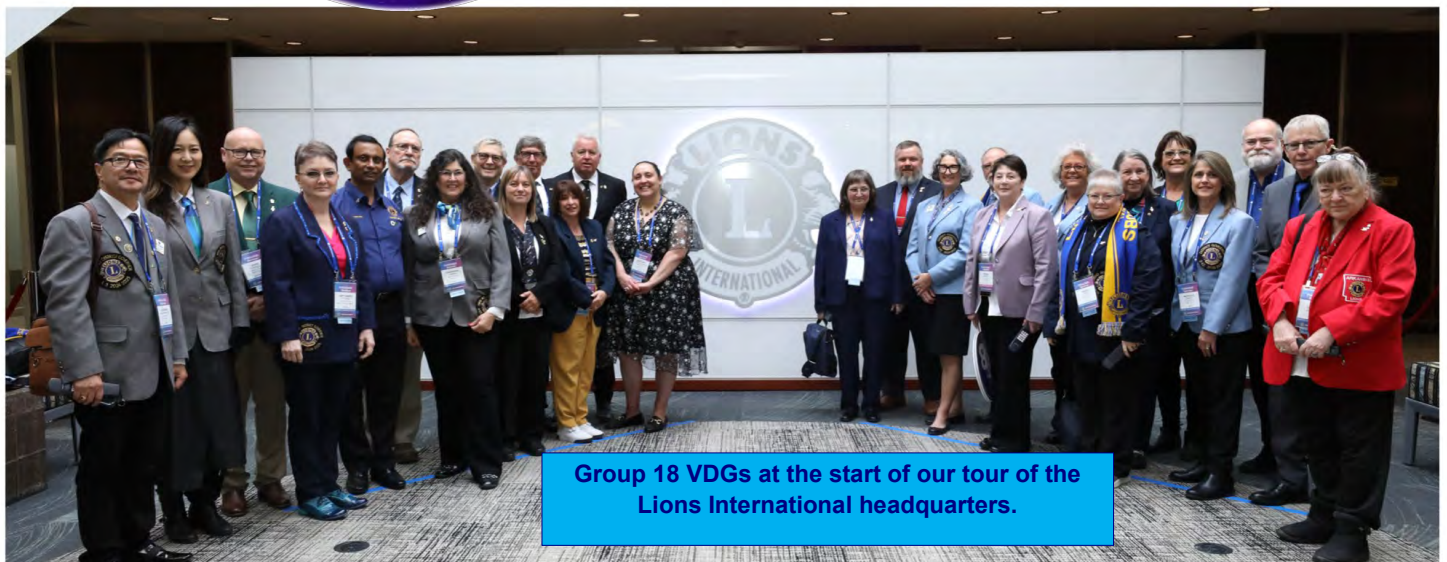
Group 18 VDGs at the start of our tour of the Lions International headquarters.