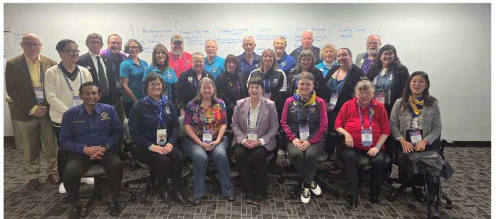
My training group has VDGs from Canada, California, Idaho, Texas, Arkansas, South Dakota, Alaska, Australia and New Zealand! Super bunch.