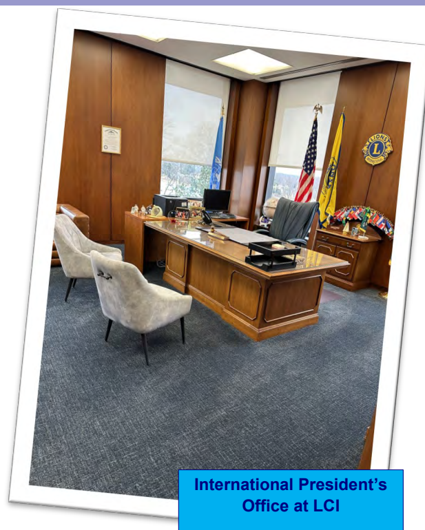
International President's Office at LCI