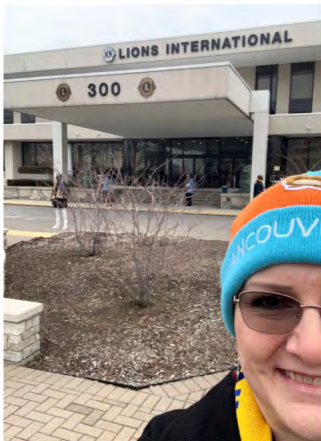
Grabbed a selfie outside the Lions International headquarters!