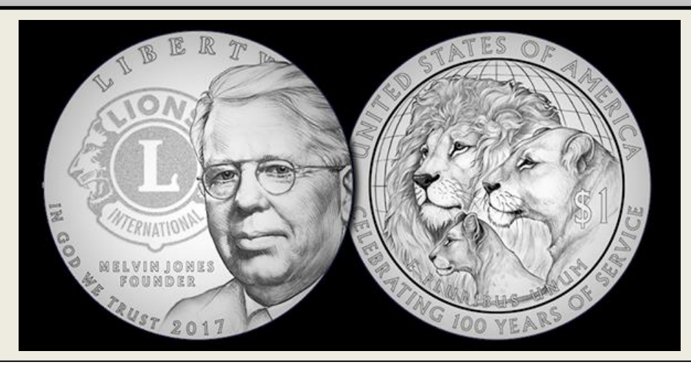
Lions Clubs International Centennial Silver Dollar Coin Designs Unveiled

WASHINGTON, D.C. - Designs for commemorative coins honoring the 100th anniversary of the founding of Lions Clubs International were unveiled today at the organization's 99th annual convention in Fukuoka, Japan.