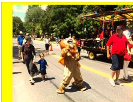
Lion Ray Out on Loan – The Takoma Park Lions Club's mascot, "Ray," has been loaned out to support the upcoming Memorial Day Parade and other District 22-C activities.