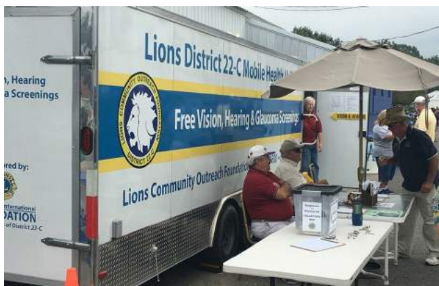
St. Mary's County Clubs participating in the St. Mary's County Fair in Leonardtown from 22 to 25 September included Hollywood, Leonardtown, Lexington Park and Mechanicsville.