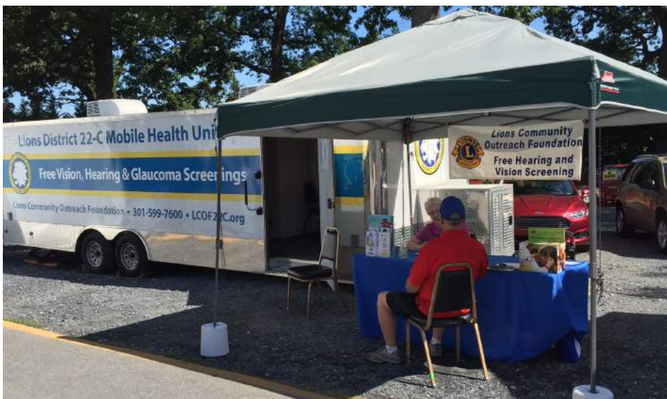
Montgomery County Lions Clubs cooperated in providing vision, hearing and glaucoma screenings at the Montgomery County Fair in Gaithersburg during 12-20 August 2016.

Participating Clubs included Monocacy, Damascus, Laytonsville, Montgomery Central-Derwood, Potomac, Rockville, Leisure World, Sandy Spring and Olney