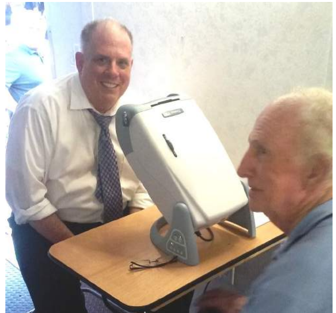
Maryland Governor Larry Hogan had his vision checked by the Beltsville Lions at National Night Out on 3 August 2016