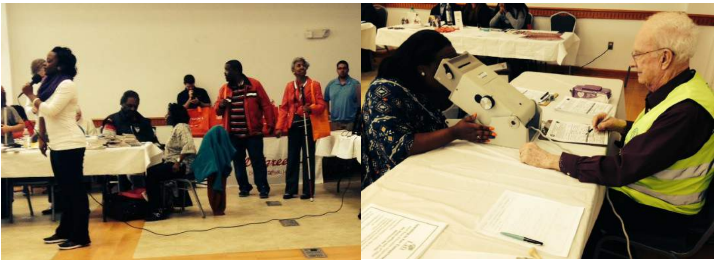
Beltsville Lions offered vision screening at the 7th annual County Resource Day for blind and low vision persons that was held on November 5th at the Colmar Manor Town Hall. The event was sponsored by the National Harbor Chapter of the National Federation of the Blind.

Share this information with your fellow Lions, friends and relatives and encourage them to shop on AmazonSmile.