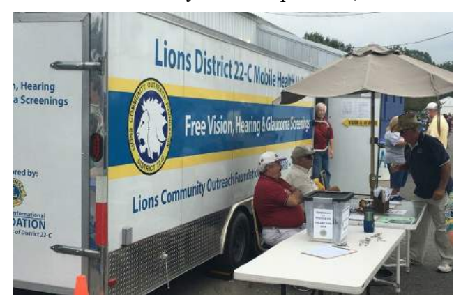
St. Mary's County Clubs participating in the St. Mary's County Fair in Leonardtown from 22 to 25 September included Hollywood, Leonardtown, Lexington Park and Mechanicsville.