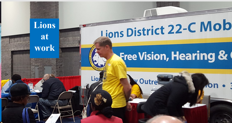
Lions at work