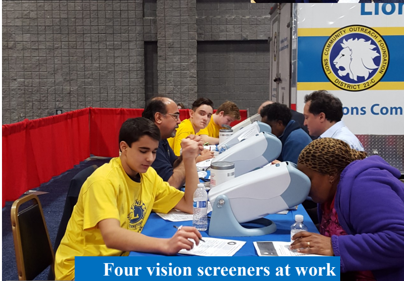
Four vision screeners at work