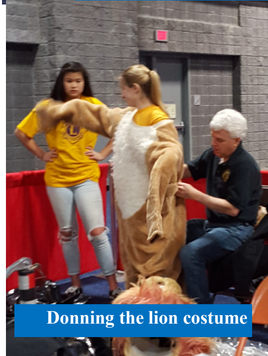
Donning the lion costume