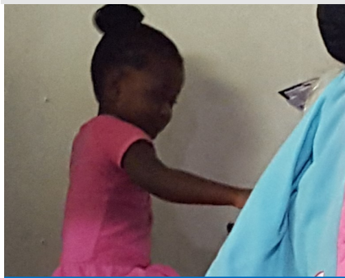
A toddler ready to be screened for amblyopia