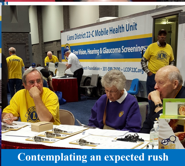
Contemplating an expected rush