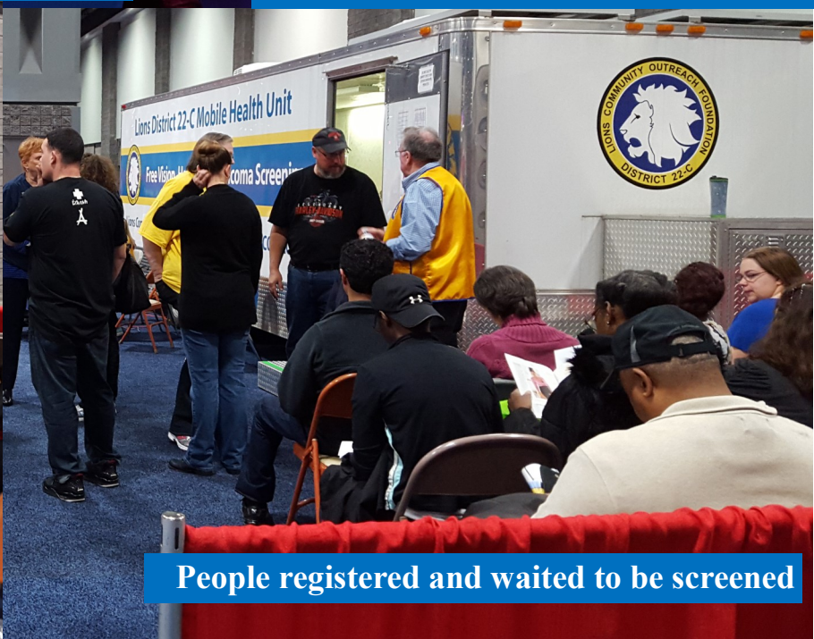
People registered and waited to be screened