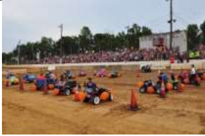
Power Wheel Derby and here is the winner with spiderman