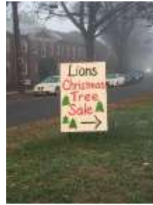
Palisades/Georgetown Lions Club