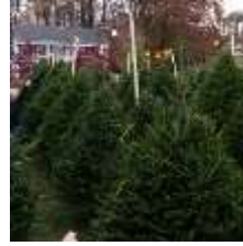
Bowie Lions Club ready

The Colesville Lions Club's, Blake High School LEO Program was busy helping at this years Thanksgiving Day parade