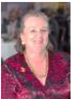
2016 Chair's Award Recipient