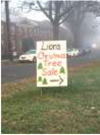
Palisades/Georgetown Lions Club