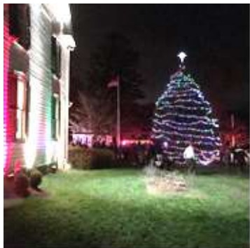
2016 Christmas Tree