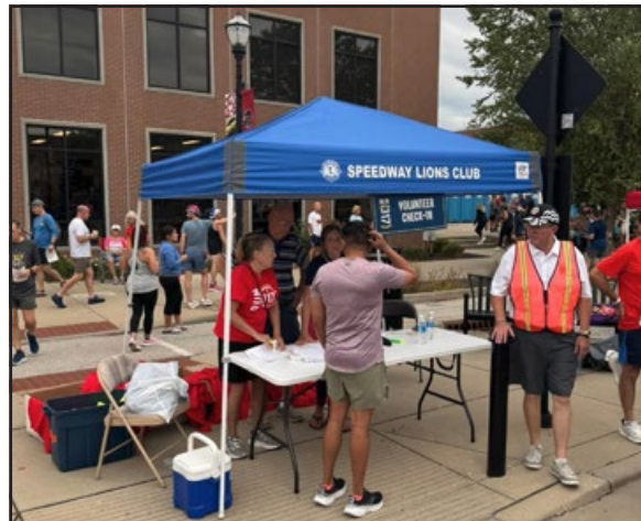
Speedway Lions volunteered with the 317 Run, a series of running events held throughout central Indiana.