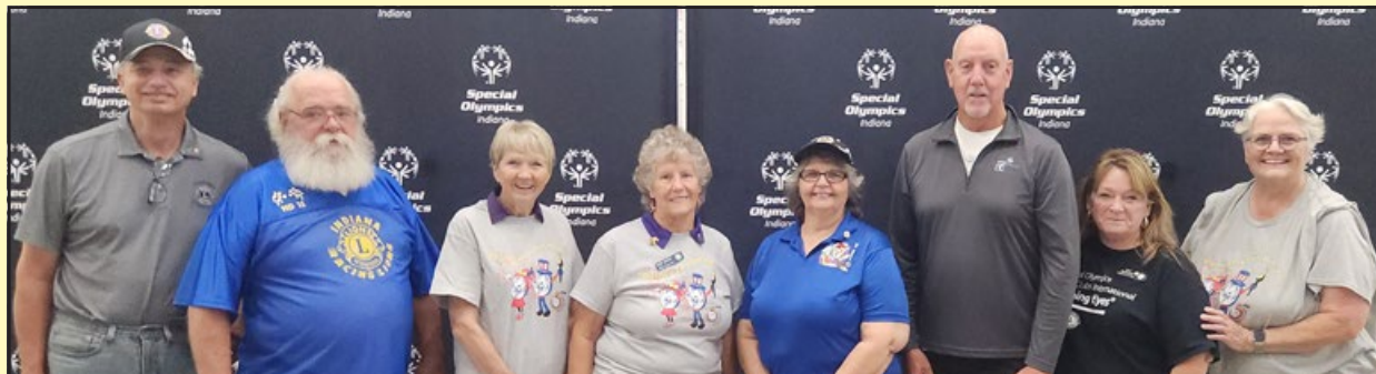
Photo provided Several Lions from District F helped out at this summer's Special Olympics Games.