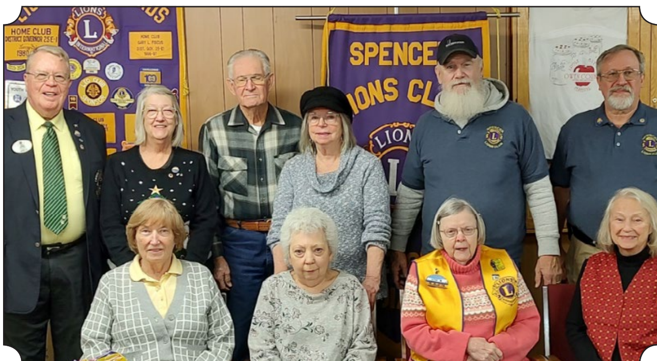
Hello, Spencer Lions!