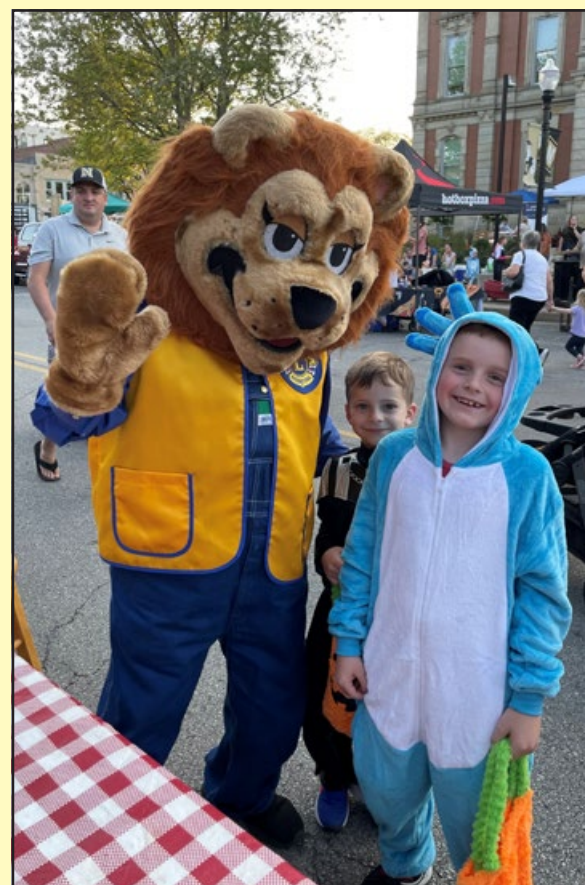
On Friday, Oct. 4, the Noblesville Lions Club served their grilled cheese sandwiches to the crowd in downtown Noblesville from 4 to 8 p.m. Also on hand was Stanley the Lion to say "hello" to the kids. (ABOVE) Stanley and two happy kids.