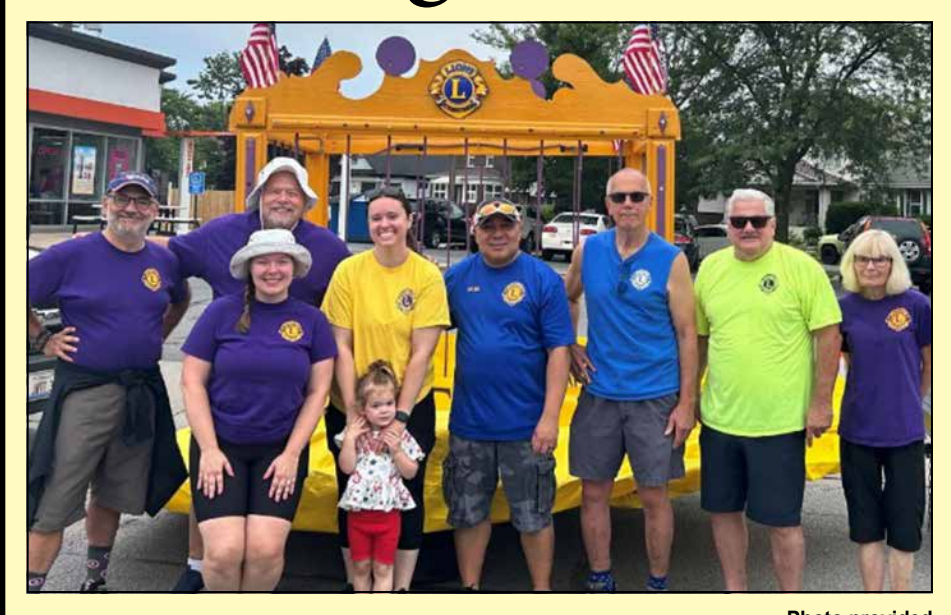
Members of the Whiting Lions Club pose prior to marching in the Whiting 4th of July Parade. The Club collected $900 for the local food pantry thanks to all who "Fed the Lion!"