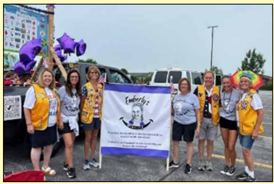
Crown Point Lions were proud to march in the Crown Point 4th of July Parade alongside Emberly's Smiles, a non-profit organization who provides Communication Boards for parks in our community. Crown Point Lions have worked with this organization to place four boards in parks around the town. For more information, check out EmberlysSmiles.org.