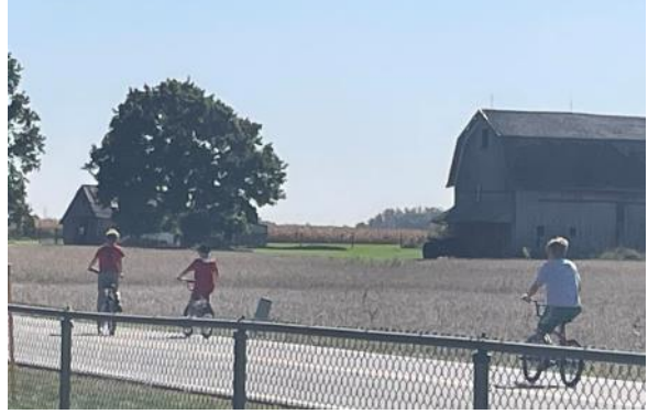
Madison Township Elementary School students participate in the annual Bike-A -Thon to raise funds for the Kids Caring and Sharing program for Riley Children's Hospital.