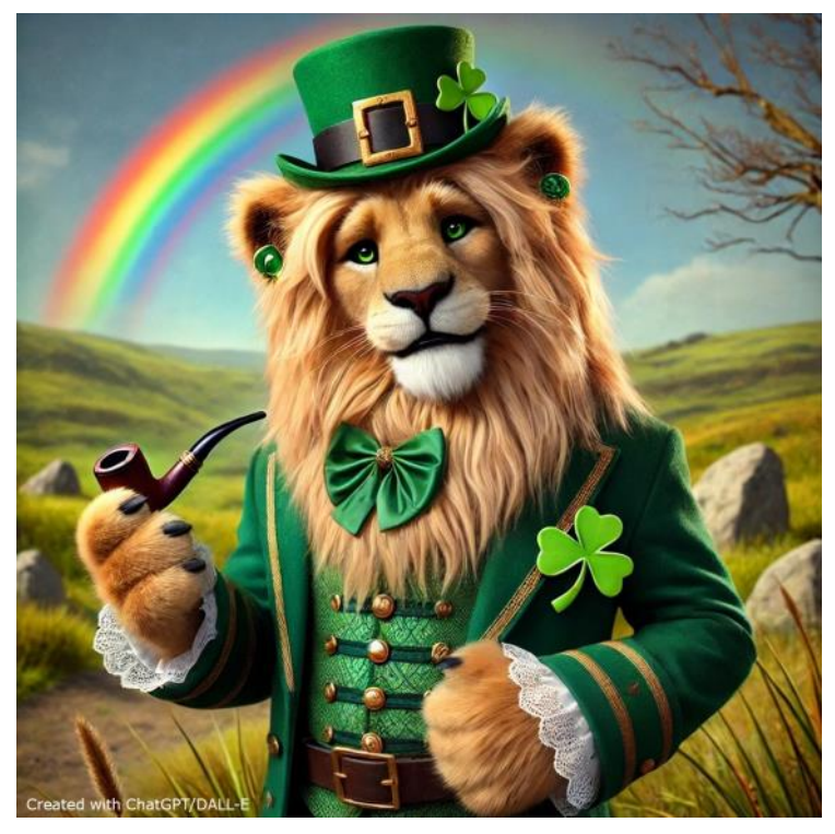
Happy St. Patrick's Day!

p. 30 Lydick Lions Club Meeting location: Lydick United Methodist Church 26510 Edison Rd. South Bend, IN 46628