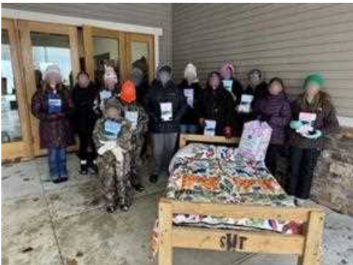
The Beaver Dam Church youth group participated in the bedding drive.