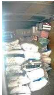
Bedding in the club trailer.