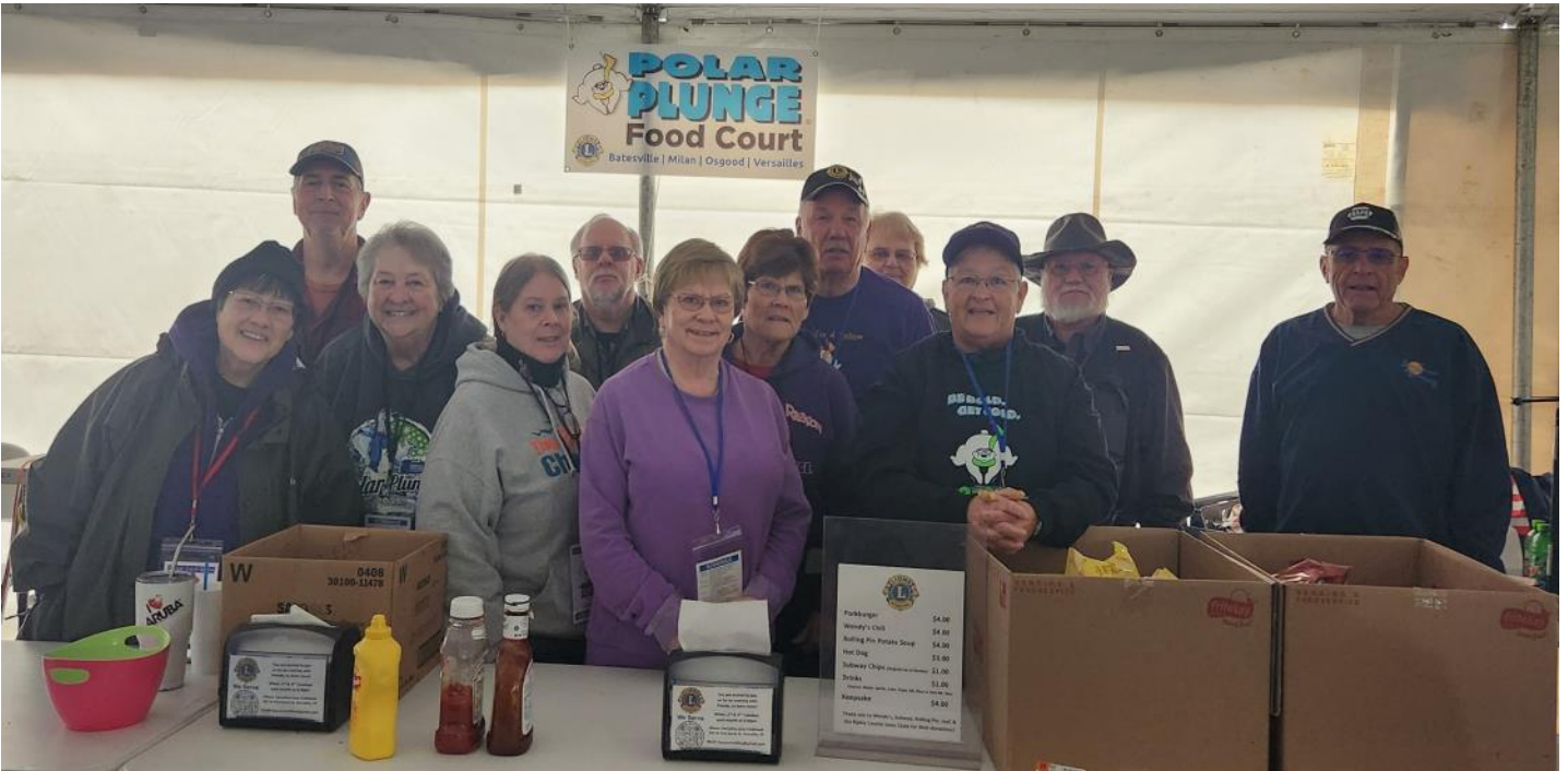
Batesville, Milan, Osgood, Versailles Lions helping out at the food booth during the Polar Plunge.