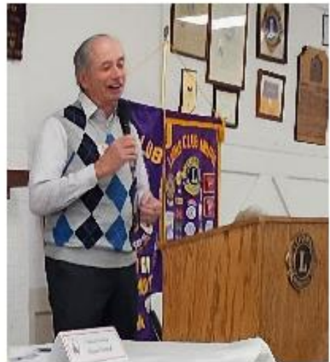
PCC Reed Fish