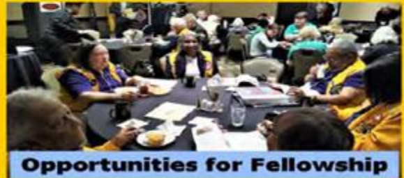
Opportunities for Fellowship