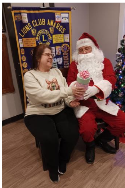
Fun at the Council Christmas Party!