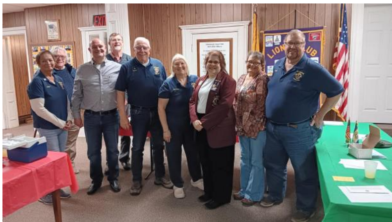
Edinburgh Lions Club