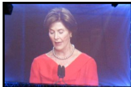
Former US First Lady Laura Bush, Keynote Speaker.