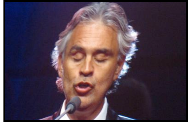
Tenor Andrea Bocelli received the 2013 Lions Humanitarian Service Award. This is the highest award of the Lions In-