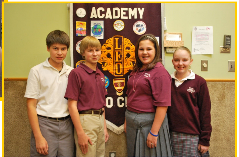
Wilkes Barre Academy Leo Club Officers 2012-2013