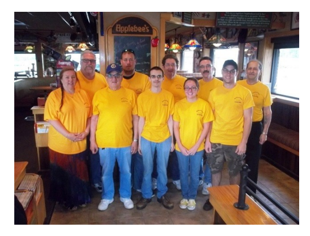
The Hazleton Lions at their Applebee's Breakfast Fund Raiser.