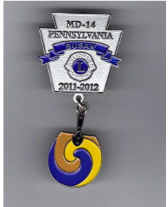
The 2011-2012 Silver Pin with the Fan