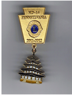
The 2011-2012 Gold Pin with the Pagoda