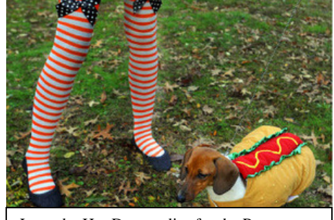
Lucy the Hot Dog readies for the Parsons section of Wilkes-Barre Crime Watch Halloween parade.