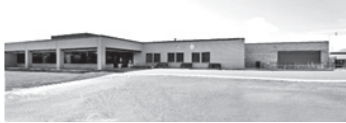
Previous Canine Development Center

The capital campaign to renovate the existing "kennel" is in