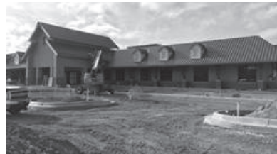
Renovation in progress on the Improved Canine Development Center

the most comprehensive renovation project this building has undergone. The Caine Development Center is aptly named because it isn't just our kennel but houses puppy development, a veterinary center, breeding program and the staff and volunteers.