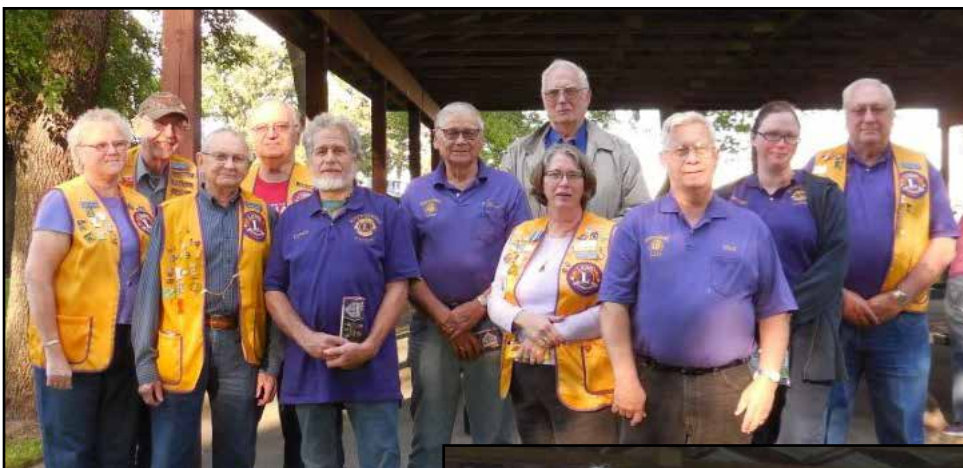
Right: Newly elected officers of the Montgomery Lions for 2017-2018.