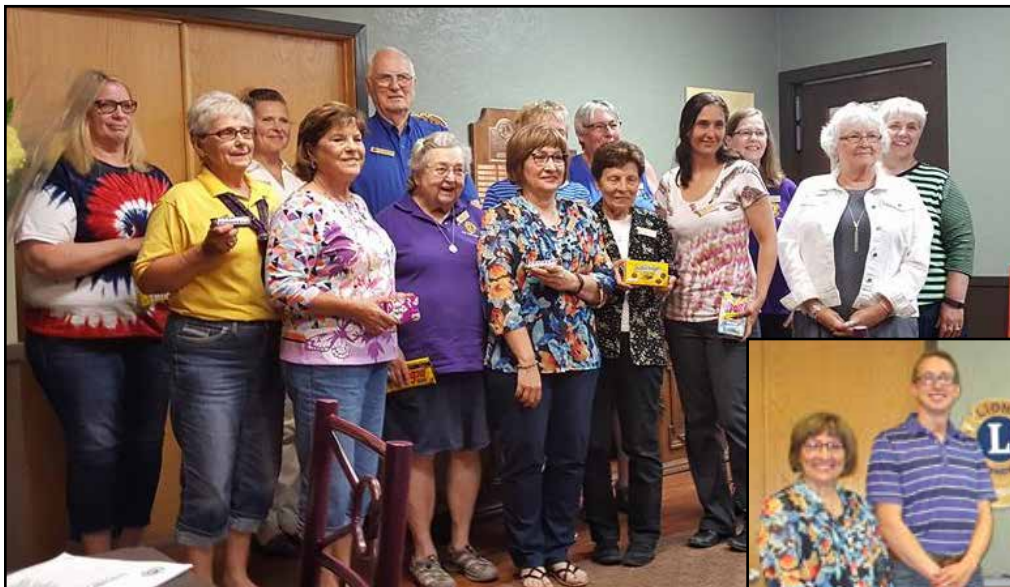
Left: 2017/2018 Board members.