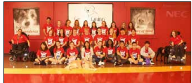
Can Do Canines is always a hit.