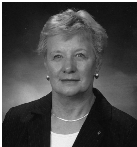
District Governor Eunice Rucks