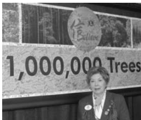
President Tam's goal is planting 1 million trees worldwide. Each incoming Governor signed their tree goal on the banner. When the pledges were totaled, the total was nearing 5 millions. 5M2 pledged 650, but I believe 4 times that is possible (one tree per member).