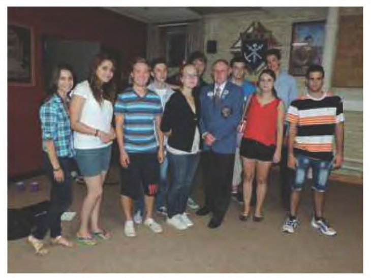
Governor with youth exchange students that were placed in 5M2