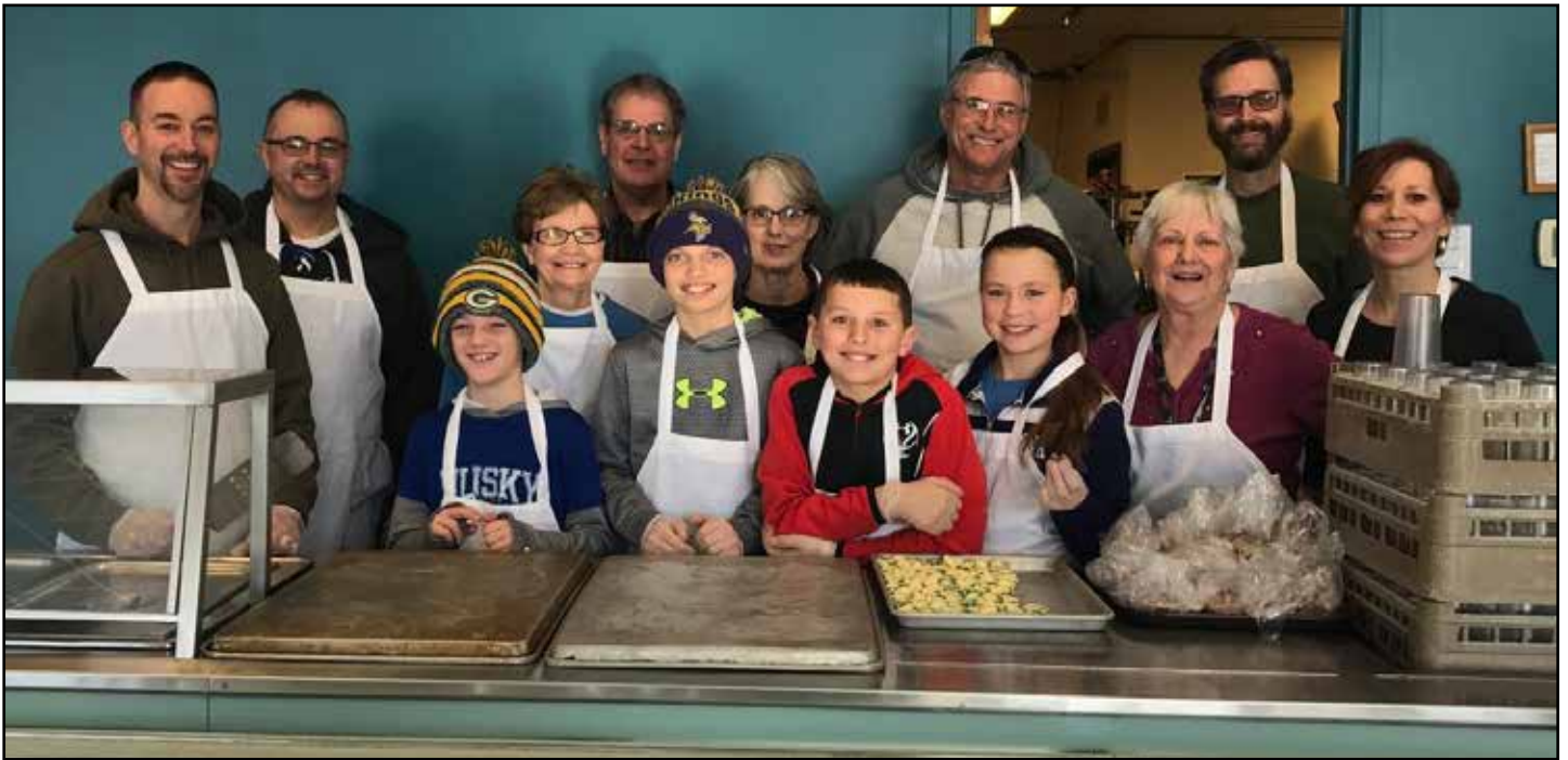
Lake Crystal Lions serving lunch at Salvation Army