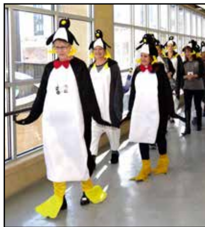
(Left) Jordan Jordaness Lions in their Penguin outfits.