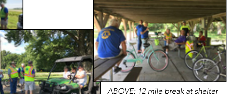
ABOVE: 12 mile break at shelter in Daly Park.