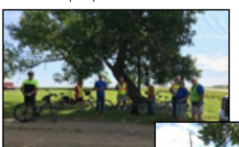
ABOVE: Water stop at Healy Farm. RIGHT: Audrey and family came out to visit with the group.