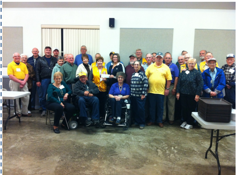
Owensville Lions received two donations towards the Sports Complex - one from the Owensville Moose Lodge and one from the Chamber of Commerce.