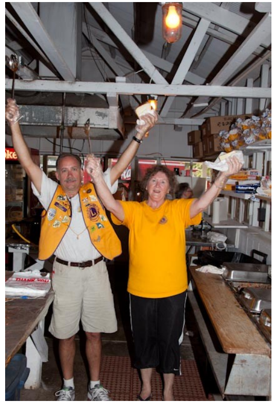
Mutton, mutton, who has the mutton? Mokane Lions Club sold mutton over Labor Day weekend.