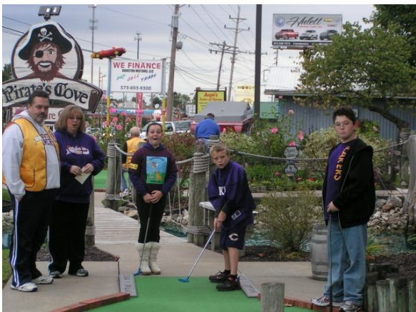
Camdenton Lions Club host a successful Miniature Golf Tourney.