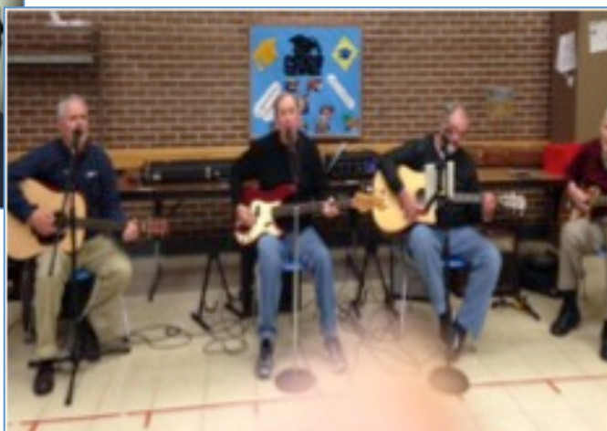
JC Evening Lions "Lions Eyes" band entertained students at Dogwood Hills School in Eldon, MO and the H. Kenneth Kirchner School, Jefferson City.