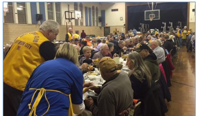
Jefferson City Host Lions serve their guests at their 60 th Annual Ham & Bean and Chili fundraiser.