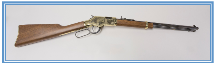
Henry Golden Boy 22LR

The Lions of District 26-M7 are raffling a “Made in the USA” Henry Golden Boy 22LR rifle with two receiver covers: a specially engraved receiver cover and a brass receiver cover for rugged use.