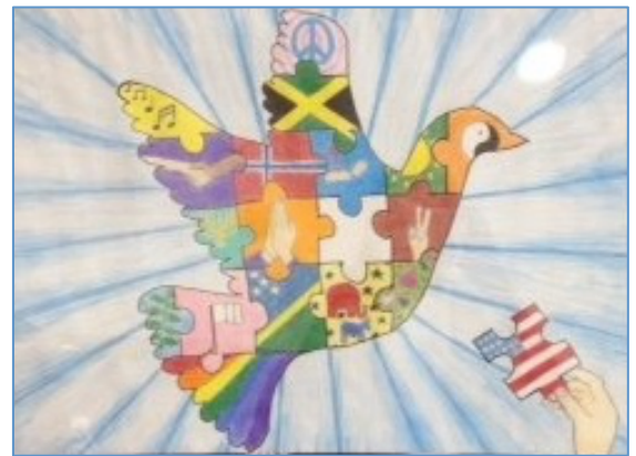
Kayanna Gaines' vision of "Share Peace."

The Peace Poster Contest was created in 1988 to give young people the opportunity to creatively express their feelings for world peace and to share their visions with the world. Approximately 600,000 children from 75 countries participate in the contest annually.