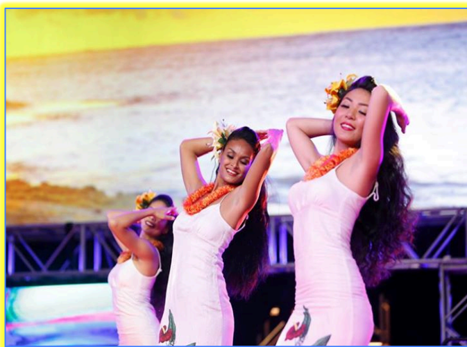
A Polynesian show preceded the second plenary session at the Lions International Convention.