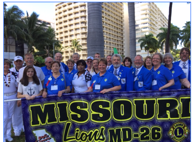
Missouri Lions and guests prepare for the international parade